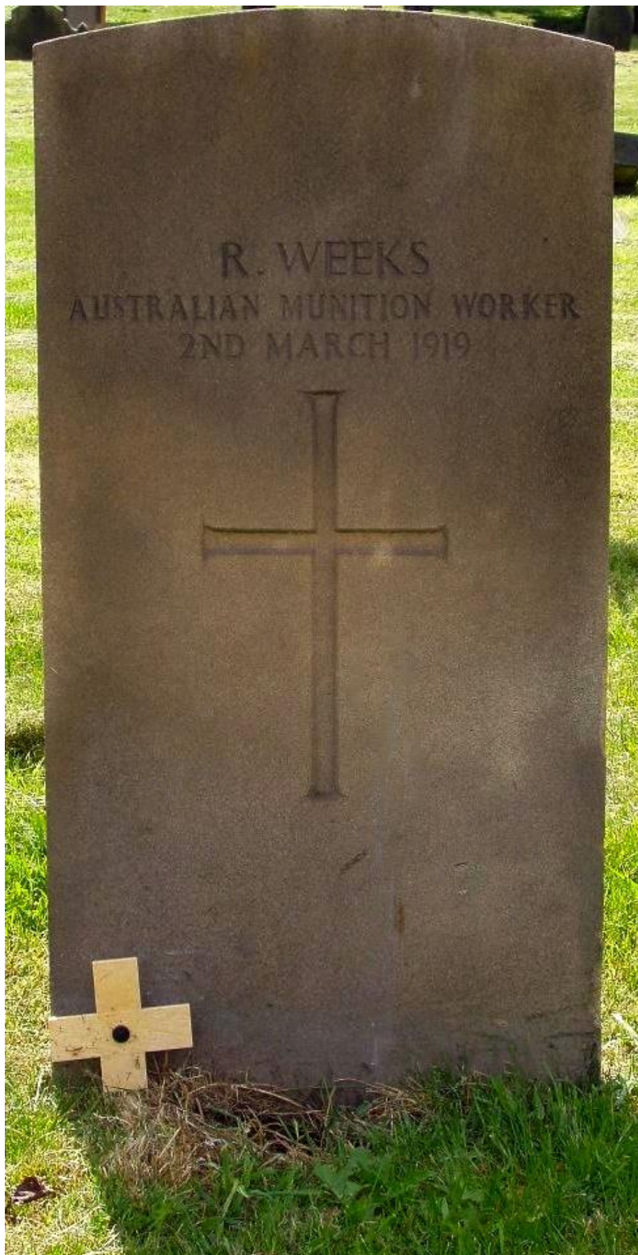
Photo of Australian Munition Worker R. Weeks' Commonwealth War Graves Commission headstone in Wakefield Cemetery, Wakefield, West Yorkshire, England.